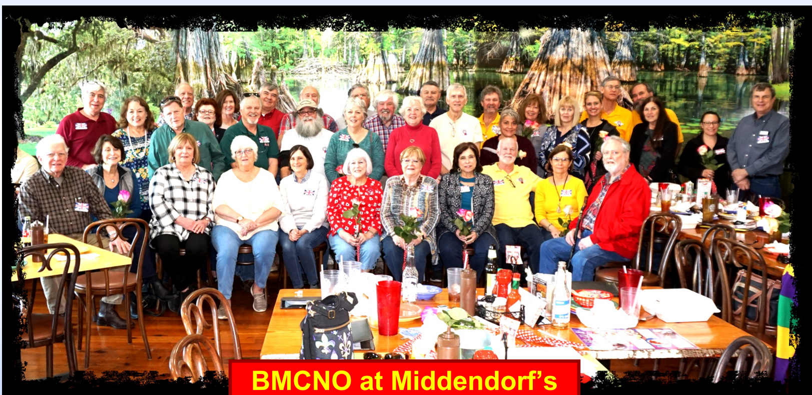
BMCNO at Middendorf's

Official publication of British Motoring Club New Orleans