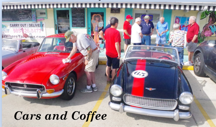
Cars and Coffee