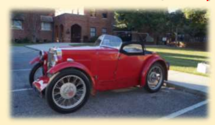
Best of Show—1930's \, MG \, M-Type Boat Tail Speedster. Purchased England in 1966 and transported to USA