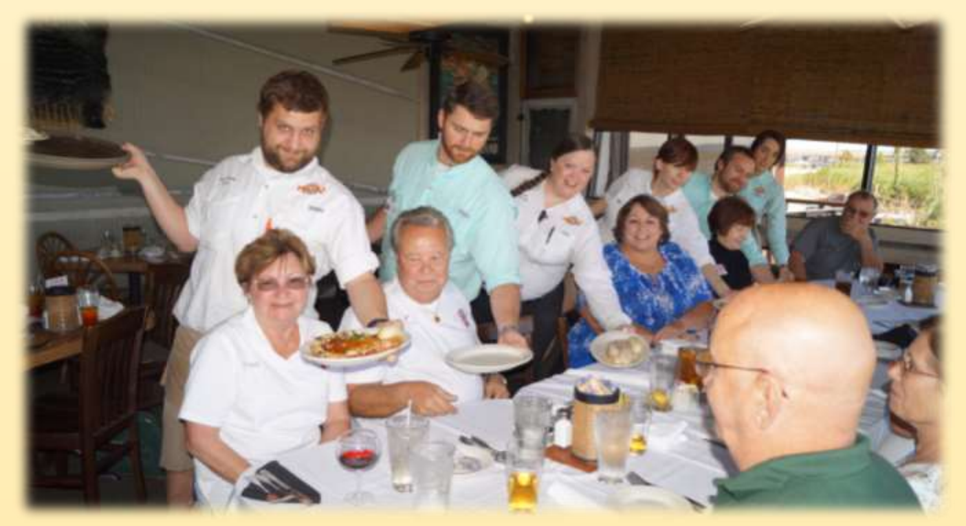
Service at Felix's Fish Camp