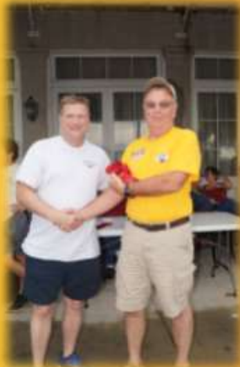
Top: Jim Clark