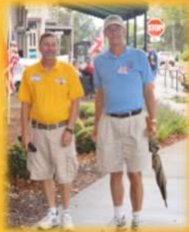
Fun Memories in Natchez with our sister club The English Motoring Club of Mississippi!!!!