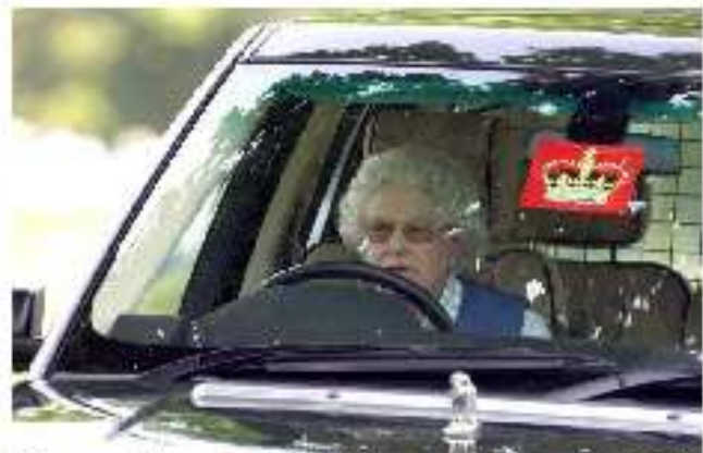
One never knows who might show up for Brits on the Bluff.