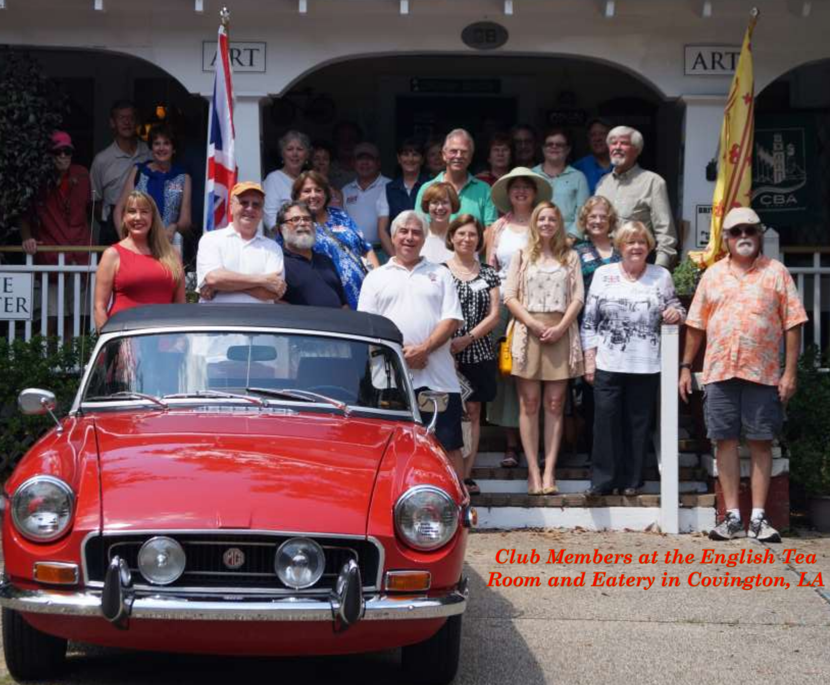
Club Members at the English Tea Room and Eatery in Covington, LA

Official publication of British Motoring Club New Orleans