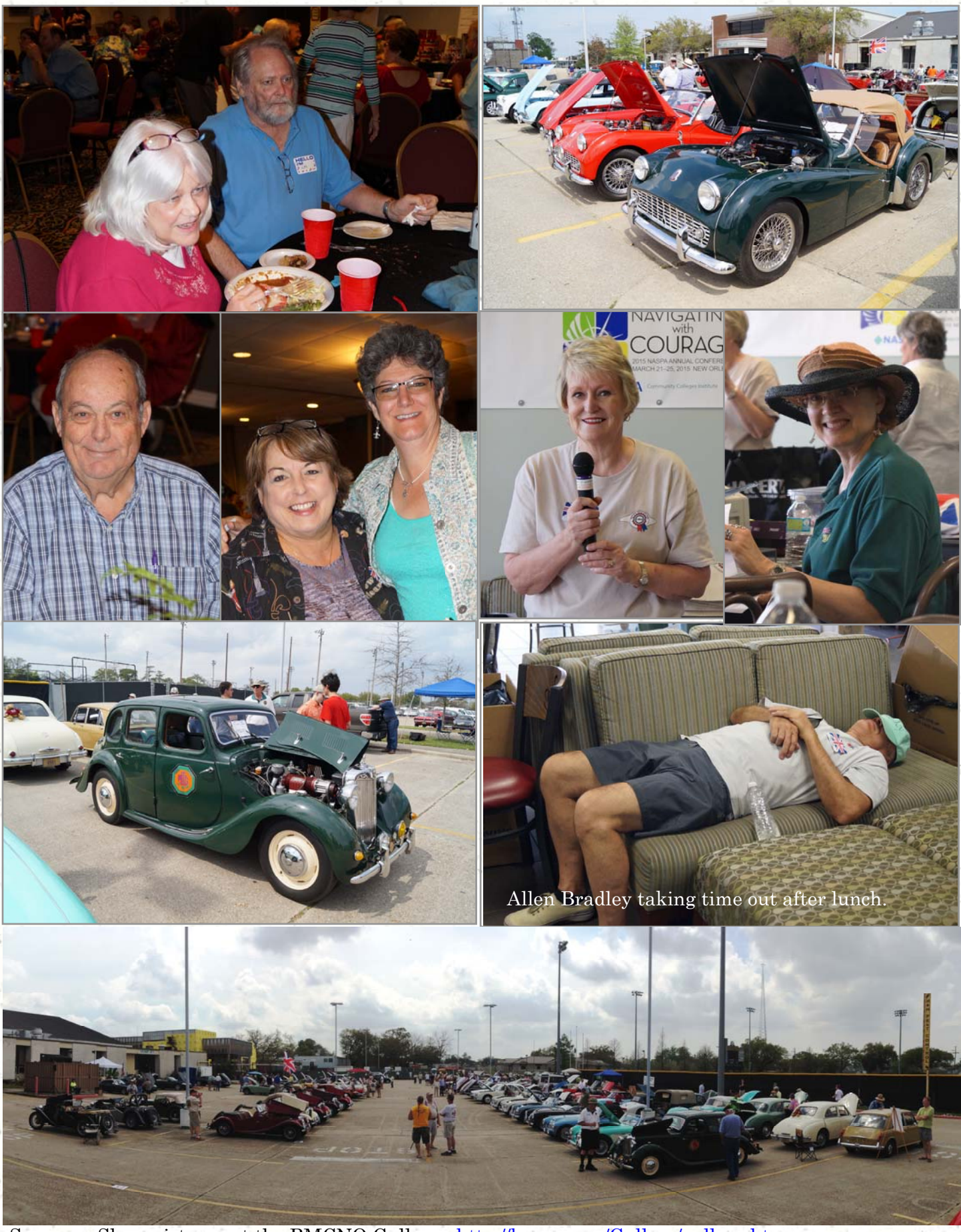
See more Show pictures at the BMCNO Gallery. http://bmcno.org/Gallery/gallery.htm