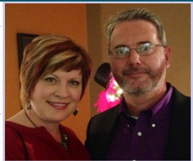
Update re: Cruisin' The Coast