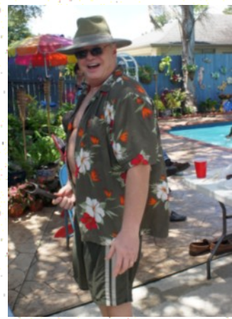
BBQ grill fork 8/21/2010