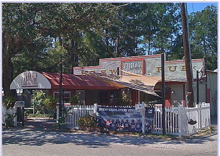
Abita Brew Pub Restaurant