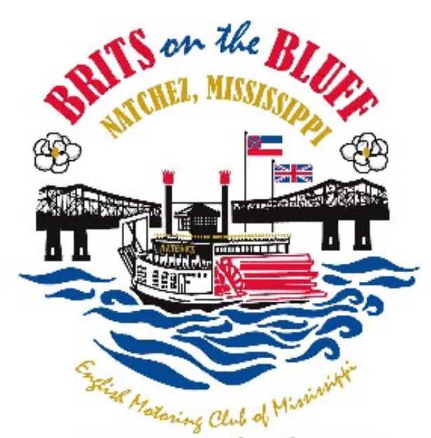
September 19th-20th, 2014