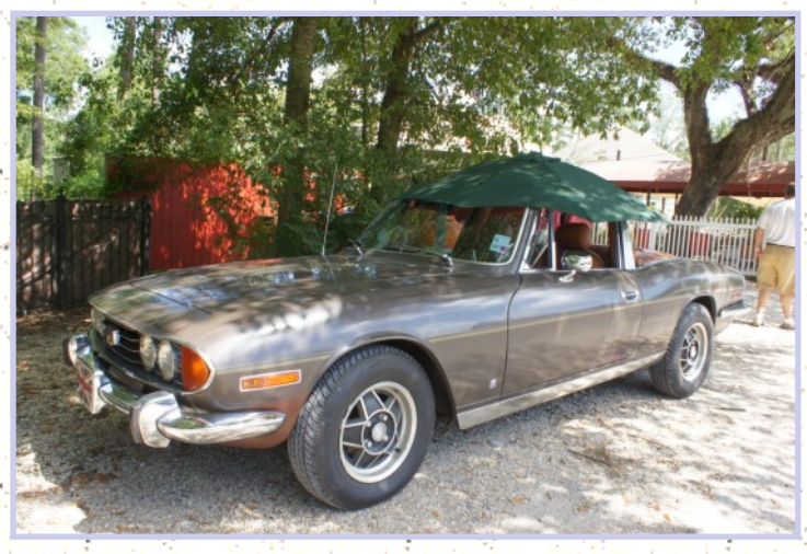
New Stag Discount hood from Wal-Mart