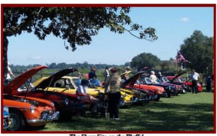
The Show Site on the Bluffs!