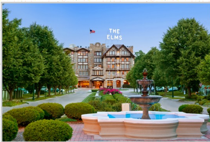
The Elms today

Excelsior Springs was a worldwide attraction for their healing mineral waters in the late 1800's to early 1900's. Our host hotel, The Elms Hotel & Spa was built in the 1880's to serve affluent mineral spa devotees.