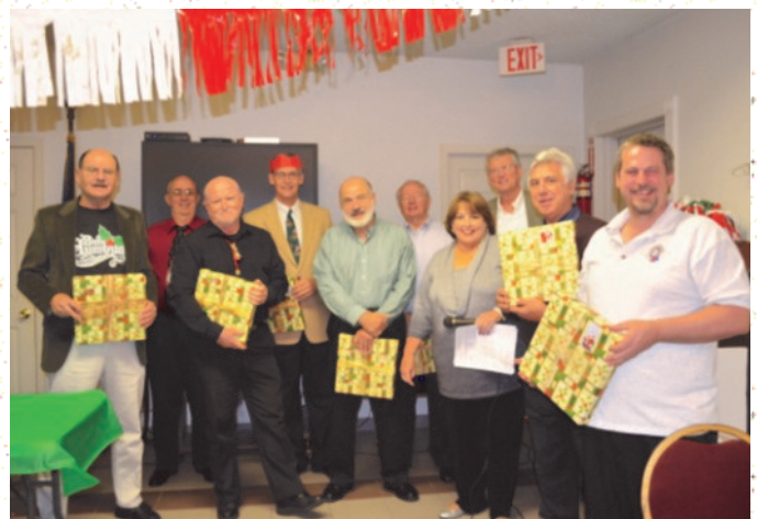
Board Members receiving appreciation gifts