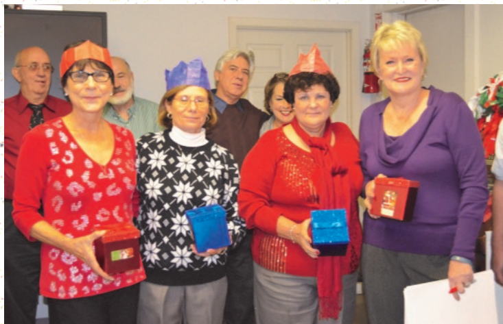
Board Member wives receiving appreciation gifts