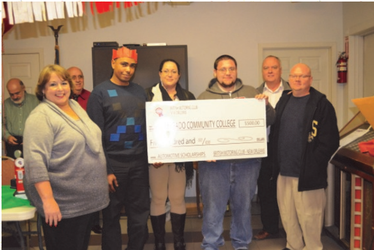
Delgado Students Receiving Scholarships