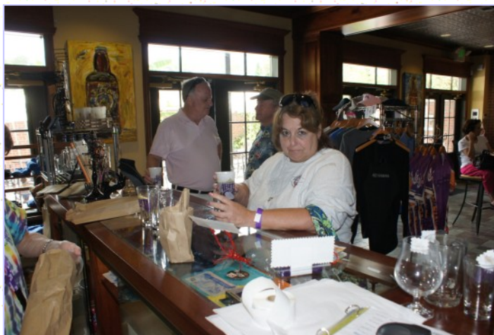
Cannot believe the turn out —oh yes, free beer!!!