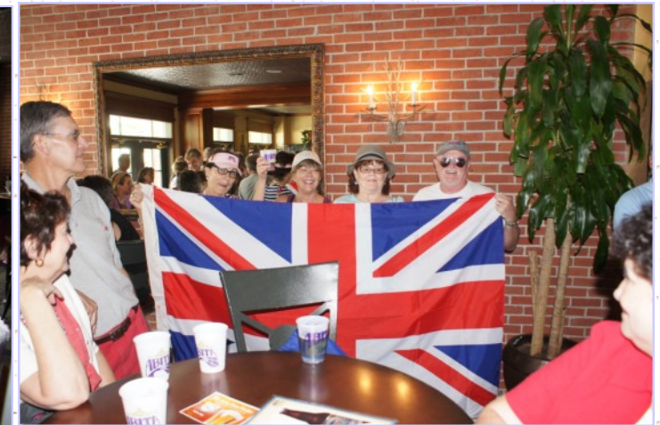
The British have arrived!!!!!!!!!!!!!!!!!!!!!!