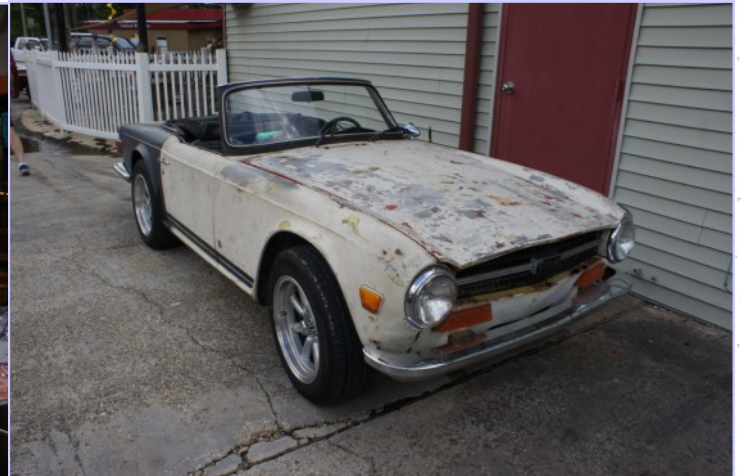
Overall Winner of the 2012 Un Car Show Owned by Pete Weber