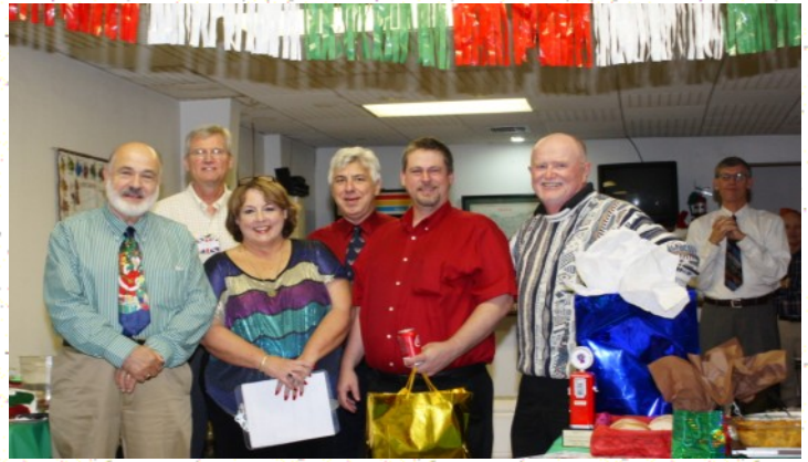
2013 Board of Directors