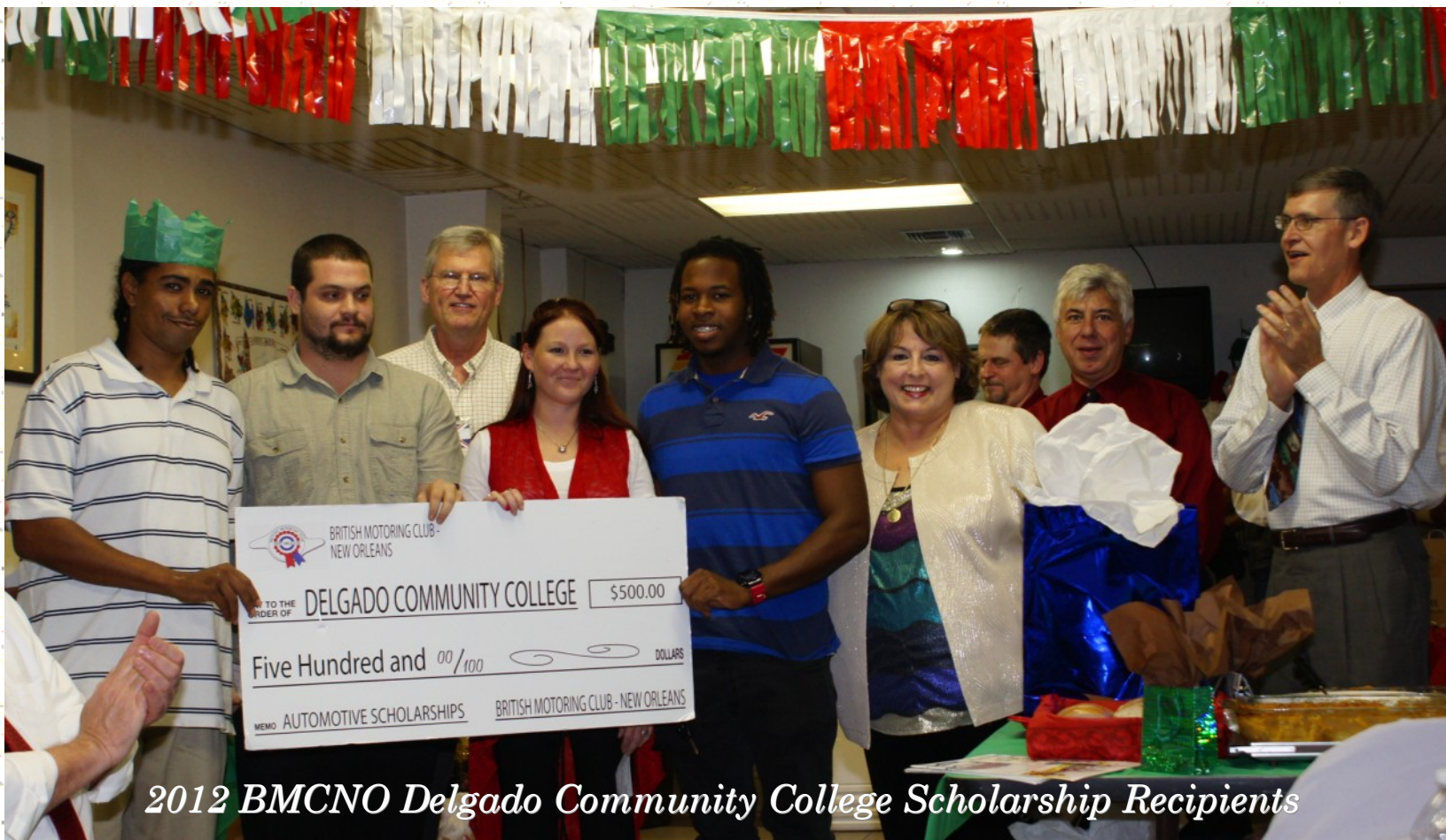
2012 BMCNO Delgado Community College Scholarship Recipients

Official publication of British Motoring Club New Orleans