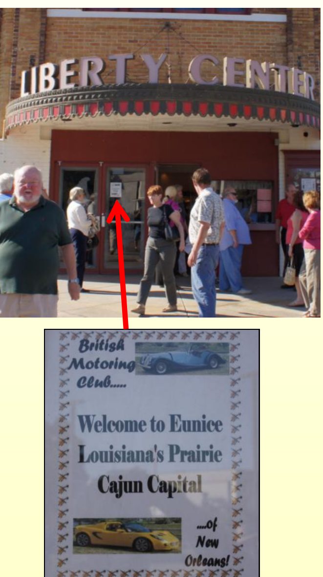
This BMCNO WELCOME TO EUNICE was posted on the front door of the Liberty Center.

See pages 15-18 for pictures from this event. Additional pictures are available on the Gallery at <u>BMCNO.ORG</u>.