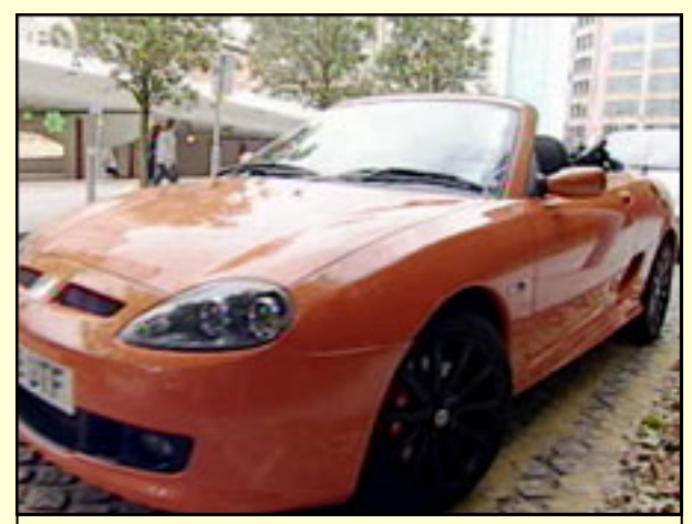
Owners SAIC say 700 MG TFs will be produced by the end of the year.