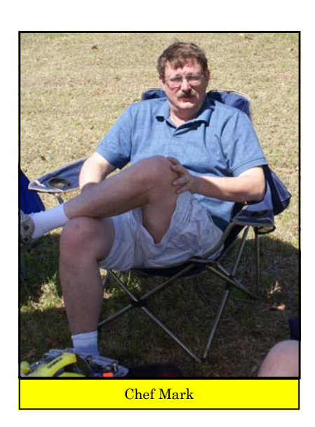
More pictures from "Brit's on the Bay" in Pensacola

(You may not need all the cornstarch or might need a 2nd batch, depending.) Bring to light boil for a couple of minutes to finish thickening.