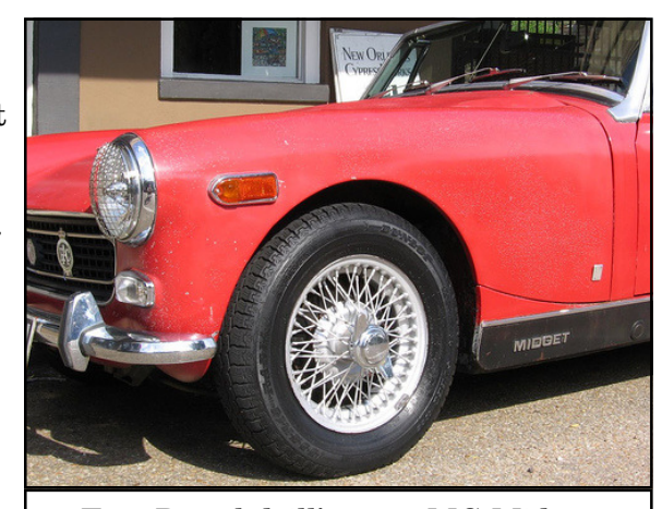
Tom Daughdrill's 1970 MG Midget