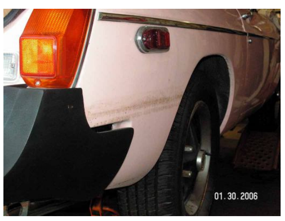
Water line on Sally Breithoff"s MGB

The wiring harnesses were in bad shape before the storm. As so often happens with British cars, previous owners had butchered things badly. No guarantee could be made for reliability with the original harnesses in place so they had to be replaced. The starter solenoid was shot and the starter itself could not be trusted. Both were replaced with locally purchased rebuilt units. The starter relay was bad.