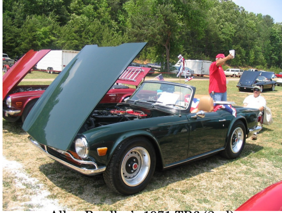
Allen Bradley's 1971 TR6 (2nd)

(See www.birminghambmc.org for full show results & photos of all entries!)§