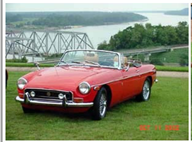
Allen Bradley's 70 MBG