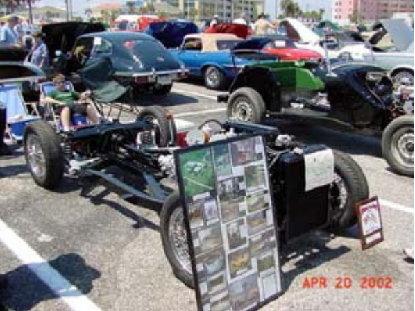
Cathy Greensfelder 79 MGB