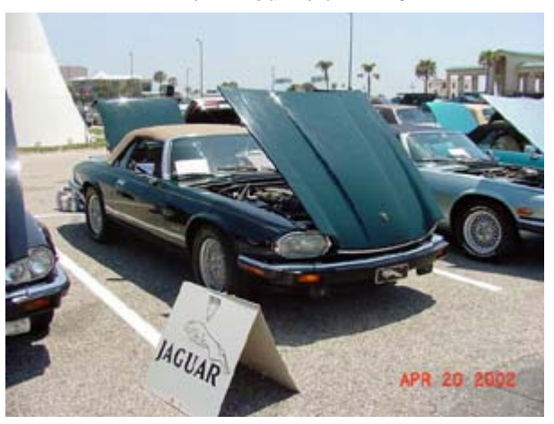
Butch Frutos' 93 Jag XJ6