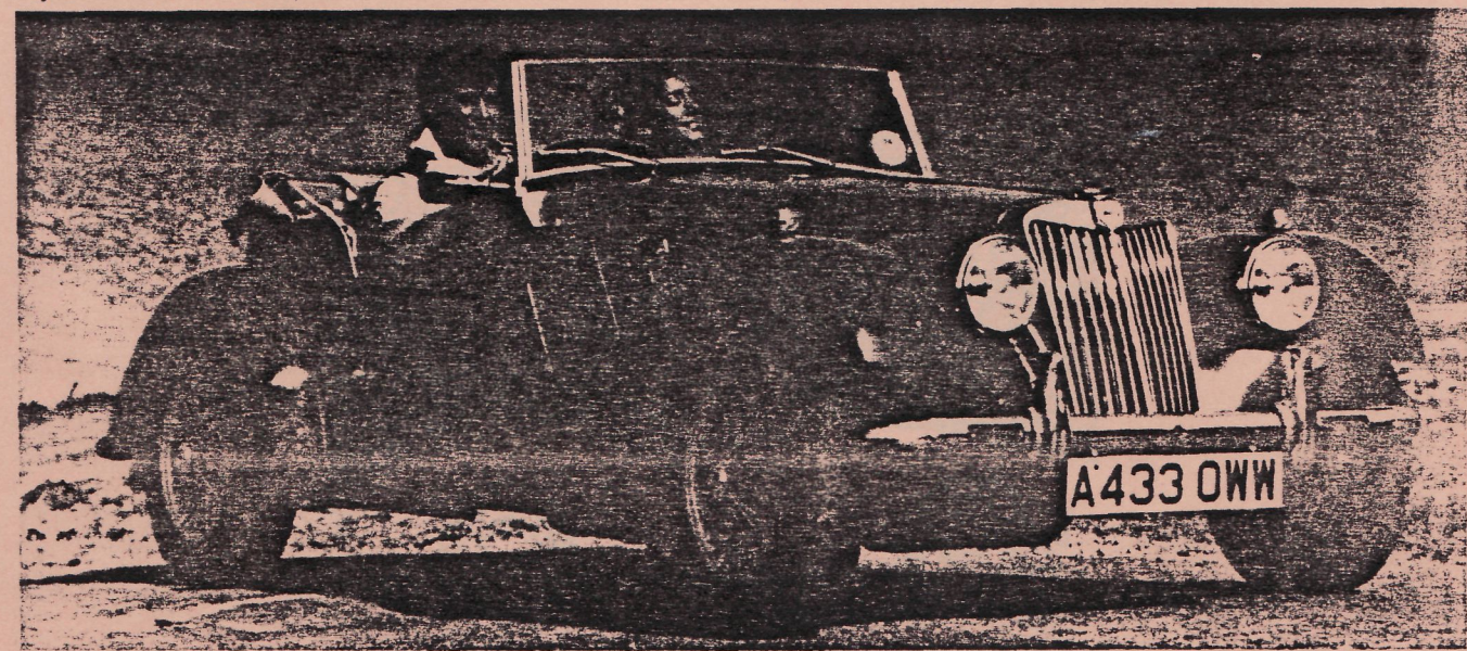
Naylor TF 1700 is close replica of MG TF model, built in 1950s. It is designed to provide good handling and sportscar excitement.

The hand-crafted, ash-framed metal panelled body as well as the wings and running boards are identical to those used in the restoration of original MGs. The octagonal MG instruments and switches have been eliminated by safety laws but the new wood veneer dashboard includes speedometer, tachometer, oil pressure, water temperature, fuel and voltage gages. A cluster of warning lights includes brake circuit failure, handbrake and oil pressure indicators.