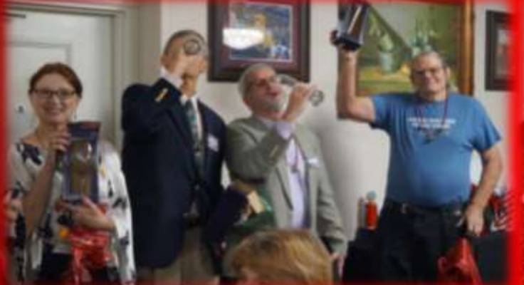
Board of Director's thank you gifts.