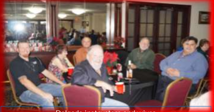
Delgado instructors and wives