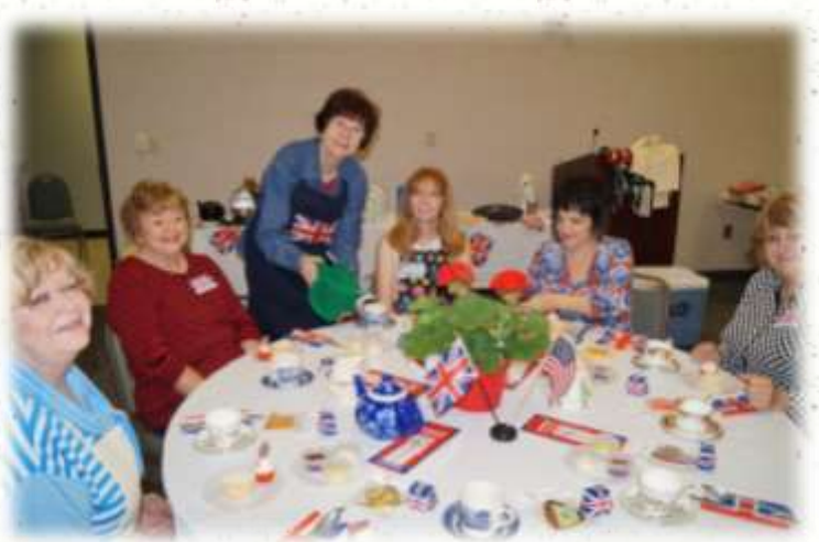
E 친구한 14 프로그램 친구한 14 프로그램 프로그램을 친구한 14