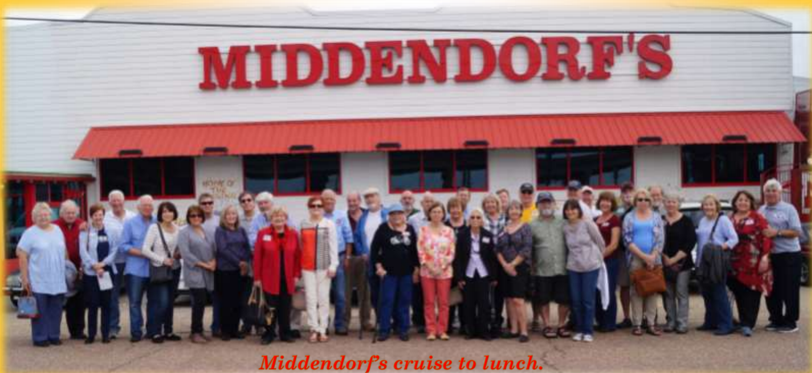
Middendorfs cruise to lunch.

Official publication of British Motoring Club New Orleans