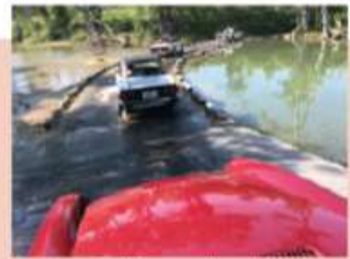
Enjoy the roads at the Gateway to the Hill Country

Join the Hill Country Triumph Club of Austin as we celebrate