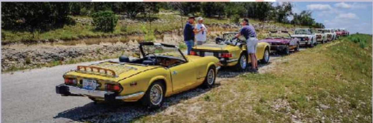
All photos courtesy Don Couch Photography