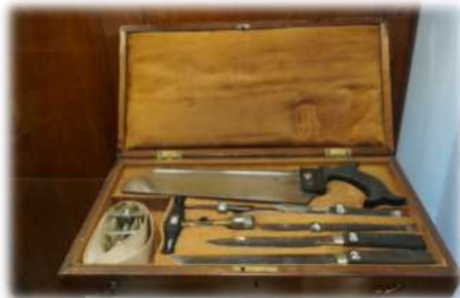
ABOVE; Medical instruments used during the war.