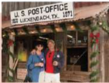
Visit Luckenbach, TX With Willie & The Boys

Join the Hill Country Triumph Club of Austin as we celebrate