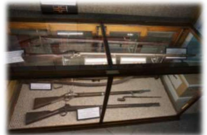
RIGHT; guns found on the property or donated.